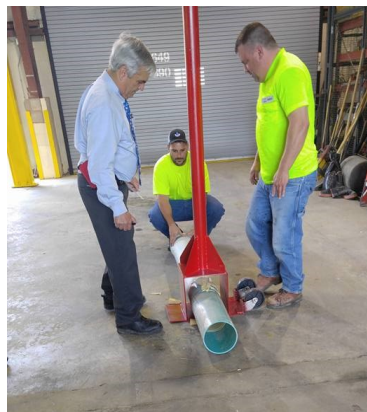
Photo shows official testing of a PrimeLiner Point Repair Kit by The Metropolitan St. Louis Sewer District.

Shelf Life: All kits have a 2 year shelf.